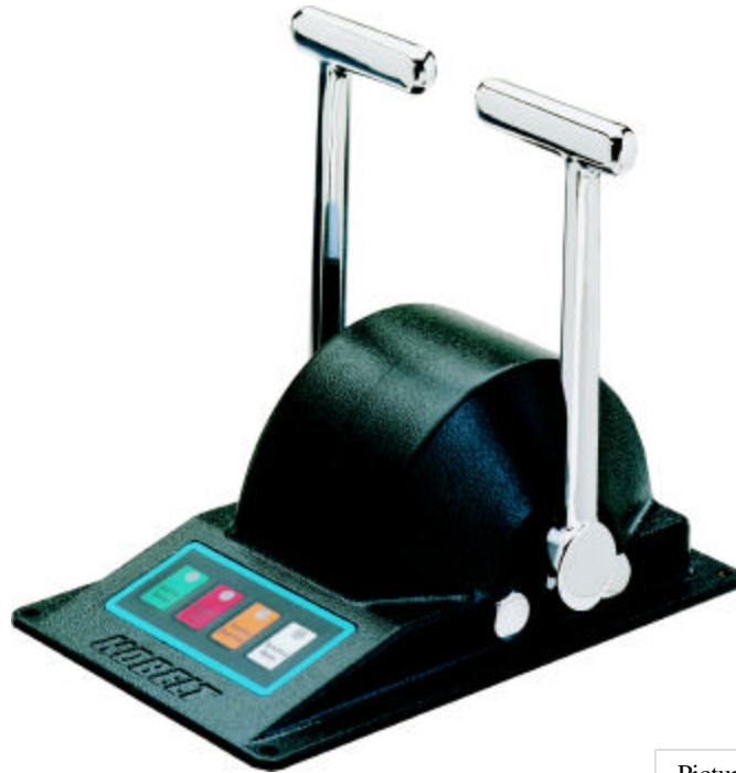
Picture showing dome with handles only